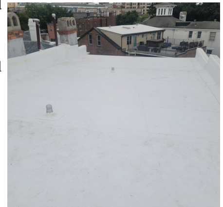
NEW ROOF @ 251 W. BUTE!

(This report was submitted for publication in mid January. There may be changes and updates since that time. If you know anyone who could use 1300 square feet, including a bar, at 251 West Bute Street for around $2,000 a month, please let us know.)